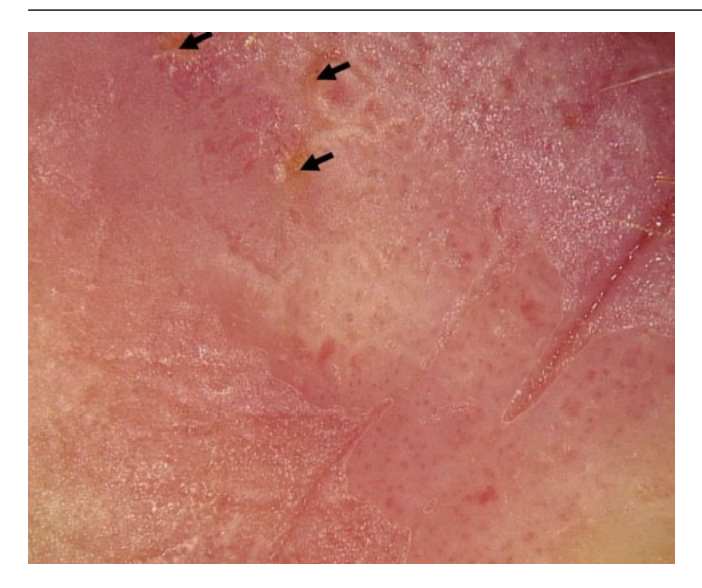
Figure 2. Dermoscopy: erythematous background with dotted vessels and orange areas (arrows).