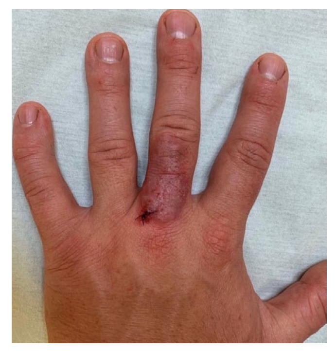
Figure 1. Skin lesion before treatment.

A 30-year old, white, Caucasian man was referred because of a single, well-demarcated plaque measuring 2 \times 4 cm, localized on third finger on left hand above proximal phalanx, without subjective symptoms (Figure 1). He did not suffer from any chronic diseases and did not take any medications. He was neither a smoker nor an alcoholic. The first lesions appeared about 3 years earlier in the form of several papules, which evolved into one gradually expanding plaque. He was treated with topical glucocorticoids and oral antibiotics (ciprofloxacin, doxycycline) for several months without any improvements. Particularly noteworthy in the interview is the fact that the patient was an ichthyologist, who was work-