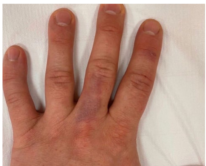
Figure 5. Skin lesion after 14 weeks treatment with sulfamethoxazole and trimethoprim.

ing mainly with a fish species called African sharptooth catfish (C. gariepinus). Laboratory tests revealed more than 2-fold increased alanine aminotransaminase (ALT) concentration (ALT 89 U/L; norm 5.0-40.0 U/L), aspartate aminotransaminase (ASP) within the norm (AST 30 U/L; norm 5.0-40.0 U/L). Viral hepatitis (anti-HCV, HbsAg negative) was excluded. The studies did not reveal any deviations in blood smear and in concentration of inflammatory markers – erythrocyte sedimentation rate (ESR), C-reactive protein (CRP). Quantiferon-TB Gold Plus was negative. Chest X-ray and abdomen ultrasound were correct. Dermoscopy of granuloma shows erythematous background with dotted vessels, orange areas and orangish hyperkeratosis globules which are not related to hair follicles (Figures 2 and 3). Ultrasound of the skin lesion confirmed that the inflammatory process was limited to the skin and subcutaneous tissue. Histopathological examination revealed abundant inflam-