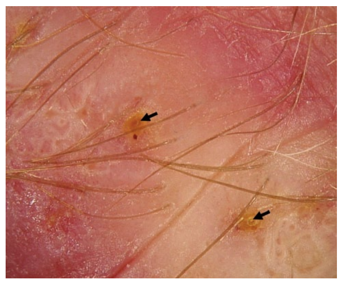
Figure 3. Dermoscopy: hyperkeratosis globules (arrows).